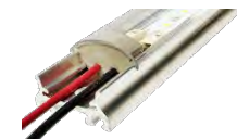
Optional Silicone End Plug